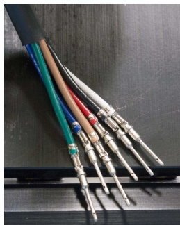
sensor wires from trim tab