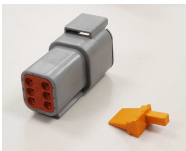
connector wedge lock