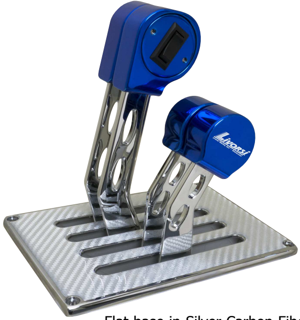
Flat base in Silver Carbon Fiber