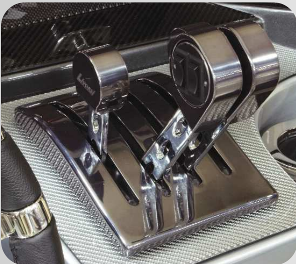
Twin engine Billet controls with Contour base and knobs in Black Smoke

Choose from flat or our new contour base; available in an array of colors, chrome or carbon fiber.