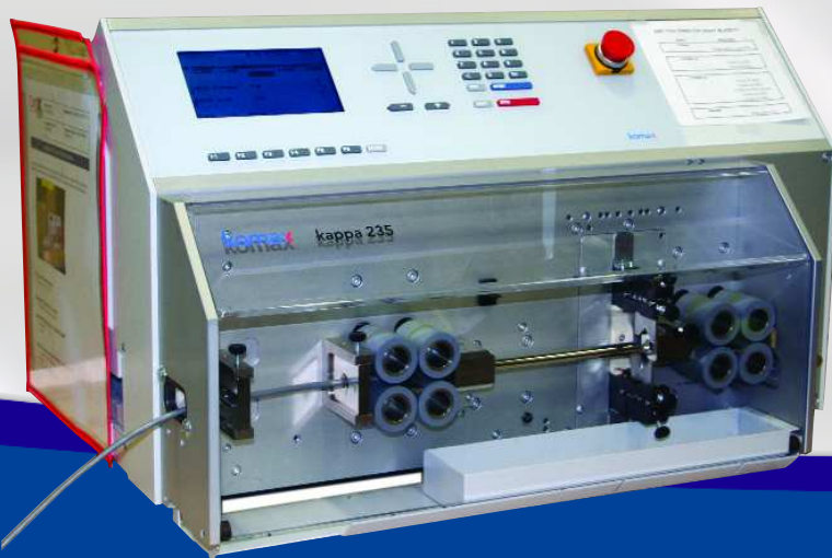
Komax 235 cutter/stripper