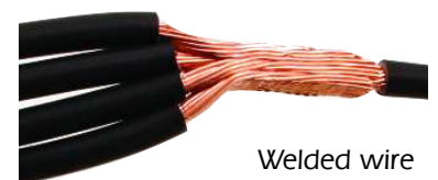
Welded wire example