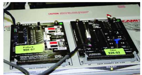
Cable Eye Testing