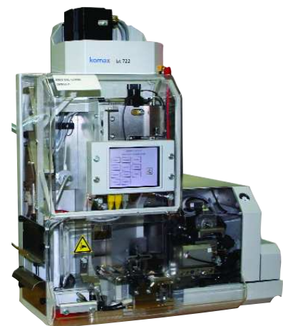
Komax BT 722 wire terminal crimper with crimp force technology

Helps reduce design time and component costs by integrating 100% quality monitored ultrasonic splice welded wires into your wire and cable harnesses. High electrical integrity with strong metallurgical bonds ensures a reliable connection between various gauges of wire.