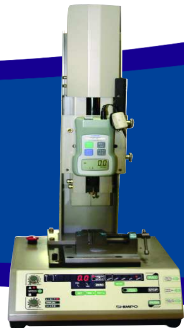
Pull Force Gauge