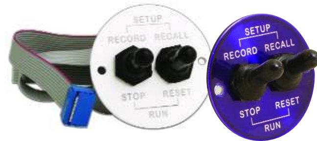
record/recall switch plate

To see a clear picture of your boats performance visit the Prop Slip webiste www.propslip.com . This site converts your recorded information in to an easy to read chart. You can even compare your boats performance to that of other boats that were tested. This service is free of charge.