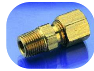
BFM 1/8" NPT male to 1/4" OD compression brass