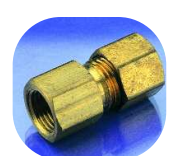
BFF 1/8" NPT female to 1/4" OD compression brass