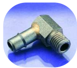
GCF7 5/16" x 24 thread male 90° angle to 1/4" push-on male