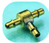
GCT1/8 1/8" x 1/8" x 1/8" push-on tee male brass