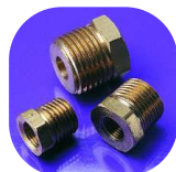
GSBKK1 Bushing Kit 1/8" NPT female to 1/4", 3/8", 1/2" male