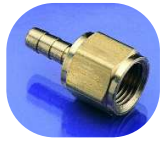
GCSF1/8 1/8" NPT female to 1/8" push-on male brass