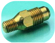
GCTF2 5/16" x 24 thread male to an #4 male brass