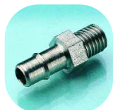
GCF8 5/16" x 24 thread male to 1/4" push-on male stainless steel