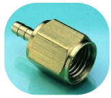
GCSM1/8 1/4" NPT female to 1/8" push-on male brass