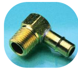
GCF6 1/8" NPT male 90° angle to 1/4" push-on male brass