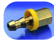
GCF4 1/8" NPT female to 1/4" push-on male brass