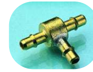
GCST1/8 1/8" NPT male to 1/8" NPT Female to 1/8" NPT Female