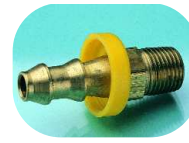
GCF5 1/8" NPT male to 1/4" push-on male brass