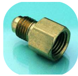
GCF2 3 1/4" NPT female to an #4 male brass