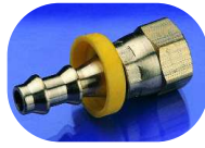
GCF1 an #4 female to 1/4" push-on male brass