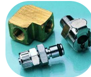
QD90F mechanical gauge 1/8" NPT female 90° elbow to 1/4" OD compression brass/chrome quick disconnect