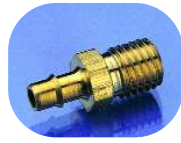
GCPM1/8 5/16" x 24 thread male to 1/8" push-on male brass